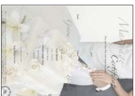
Cut the Cake

Capture the excitement and joy of a new marriage or celebrate a marriage from many years ago with a special Commemorative Marriage Certificate. With each order for a Commemorative Marriage Certificate you will receive a Standard Marriage Certificate that you can use for official purposes.